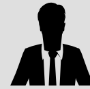
Independent Claims Supervisor