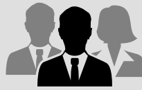
Customer Support and Administrative Team